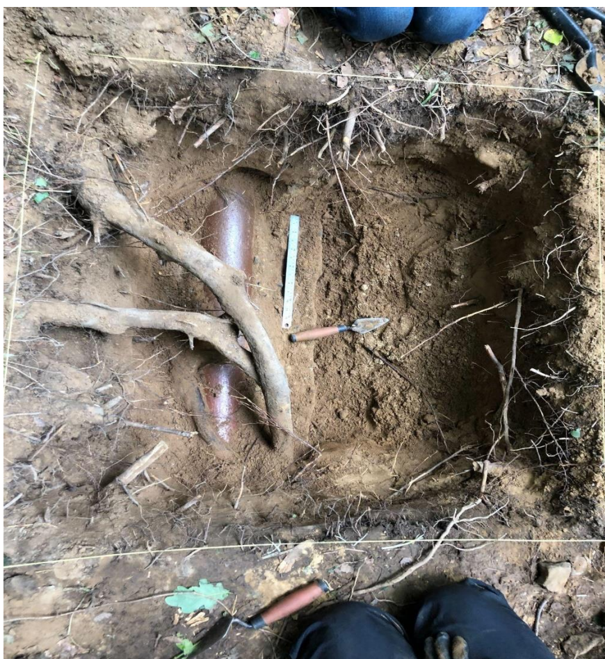
Figure 6 - Salt-glazed ceramic pipe in test pit 4 that likely connects test pits 3 and 5