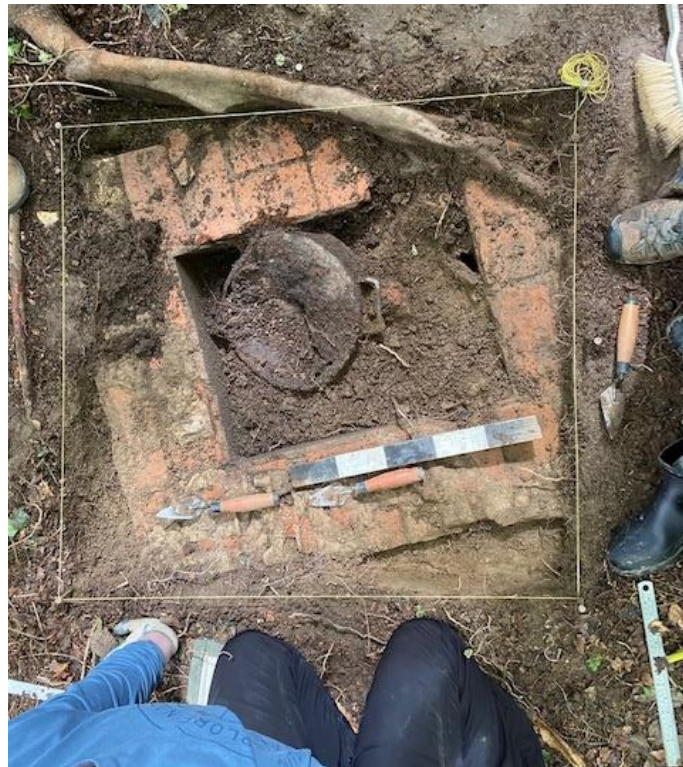
Figure 2 - Photo of test pit 1 at Level 4 with upturned cooking pot in situ

Level 7 (55-68cm): In this level, the fourth and final piece of the metal grate (small find 1002-7) was unearthed. In addition, the bottom of the brick structure was reached - unveiling sloped, concrete walls and a salt-glazed ceramic channel (Context 1003) running through the centre of the brick-lined pit. The channel stretched from the southernmost corner of the east wall, arching to flow directly into the centre of the north wall (Figure 3). Backfilled on May 26, 2022.