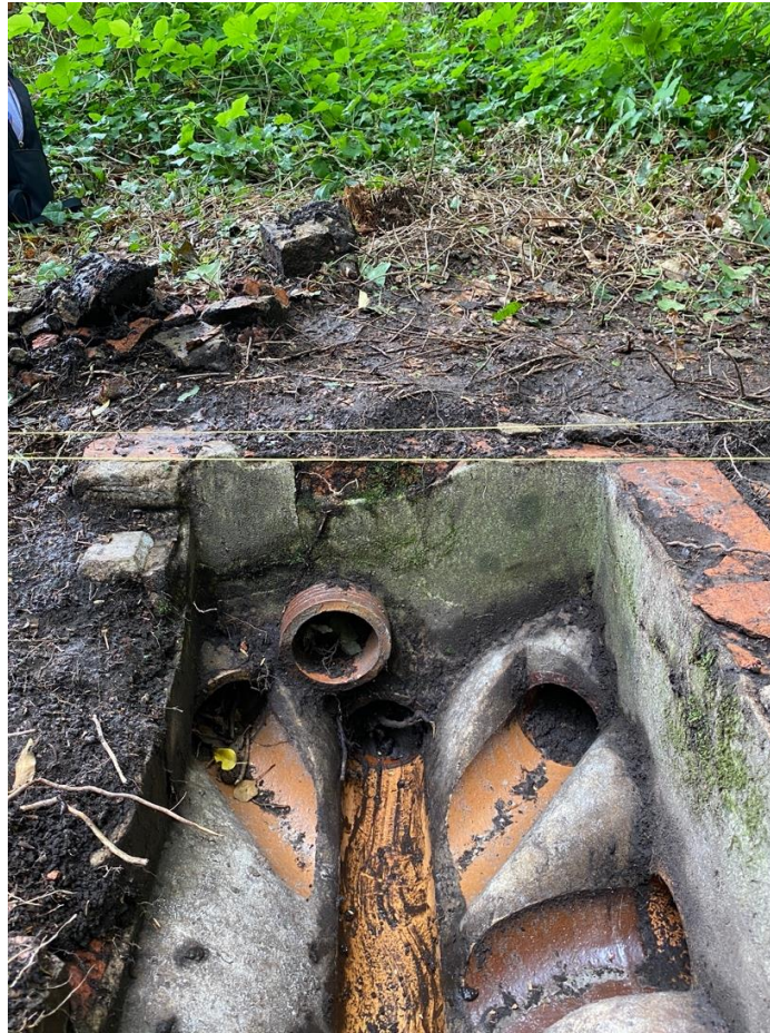
Figure 5 - Looking east at series of pipes and ceramic-lined channels in test pit 3