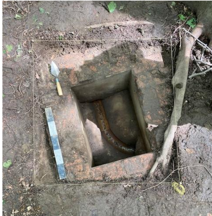
Figure 3 - Bottom of test pit 1 with ceramic-lined channel visible