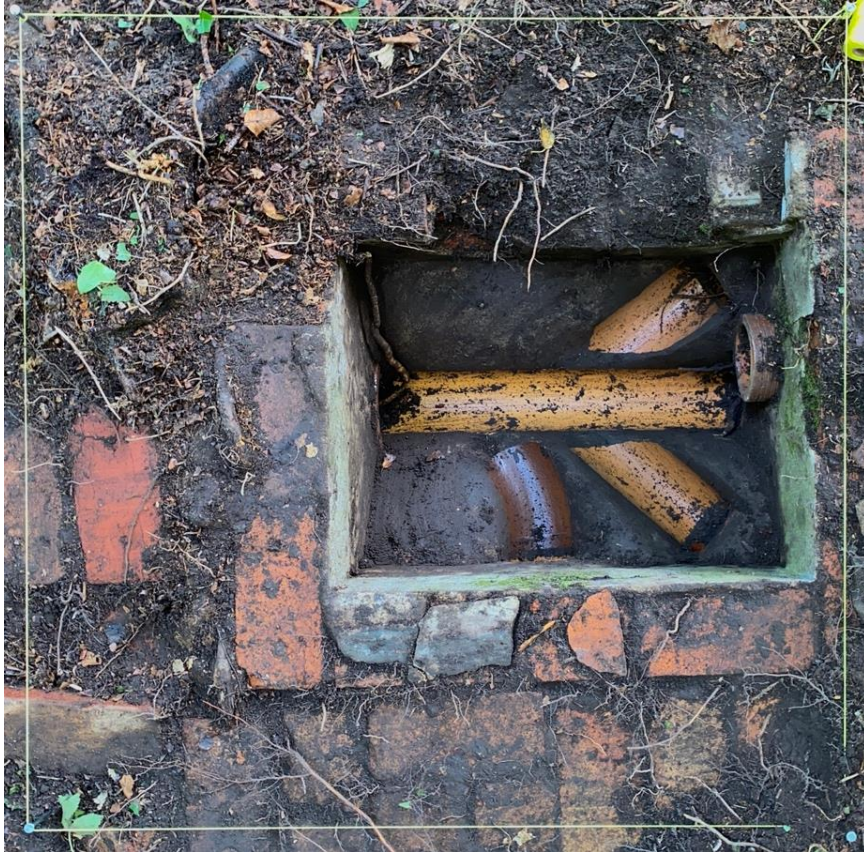
Figure 4 - Overview of test pit 3 with surrounding brick on surface

match the pipes found in test pits 4 and 5, as well as other pipe fragments found around the site. Backfilled on May 25, 2022.